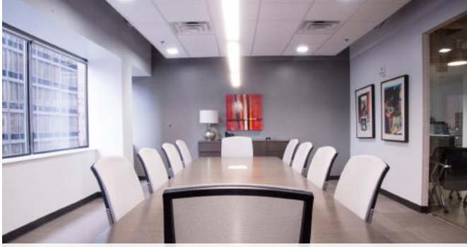
TENANT LOUNGE & CONFERENCE ROOM