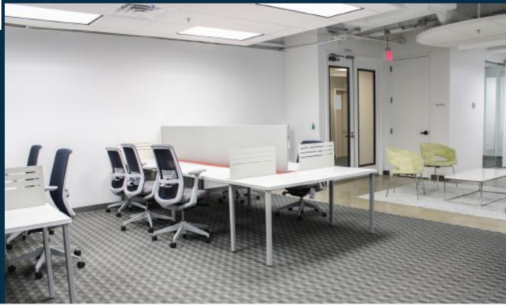
FLEXIBLE, OPEN WORK AREA