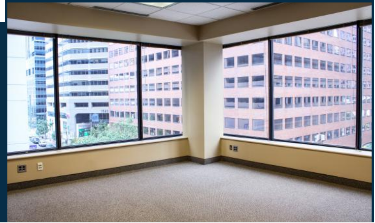
CORNER SUITE WITH VIEW OF CITY HALL