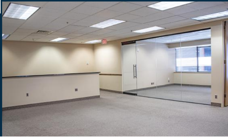
CONFERENCE ROOM & OPEN AREA