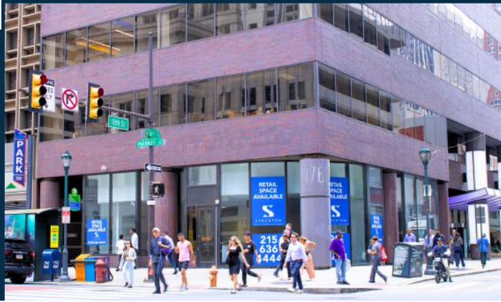
UNPARALLELED VISIBILITY & PRESENCE